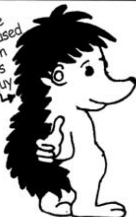
The hedgehog: a small and prickly rodent